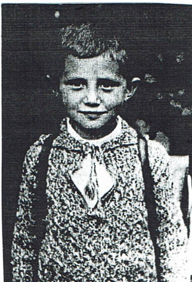
School boy and future pope, Joseph Ratzinger is pictured here in this charming photograph complete with his backpack in Aschau, Germany at the end of 1932.