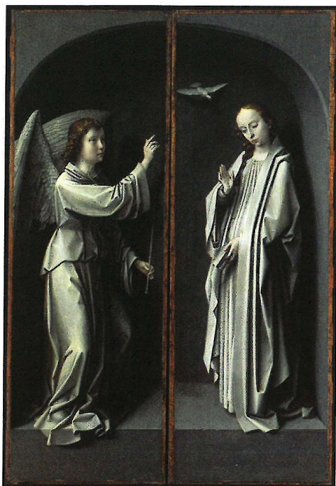
Archangel Gabriel and The Virgin Annunciate , painting by Gerard David (c.1455–1523), painted in 1510, oil on oak panel.