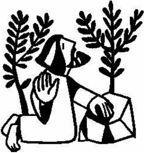
Gethsemane: The Prayer of Jesus

The kind of spirituality and prayer many of us have been used to is concerned with making things happen, asking God to do things for us, trying to do things for God. Our prayer of stillness is all about being with God without any agenda. It is about just being there.