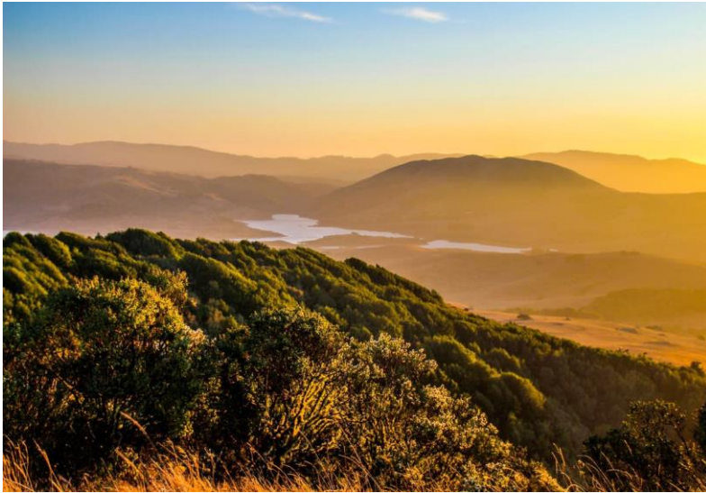
(Sunset over Black Mountains, Wales, Oct 2013)

How long we spend resting in the Lord before our vision clears can sometimes depend on how harassed or weary we are when we come to pray. For most of us the time needed in our modern world is long, longer than we believe.