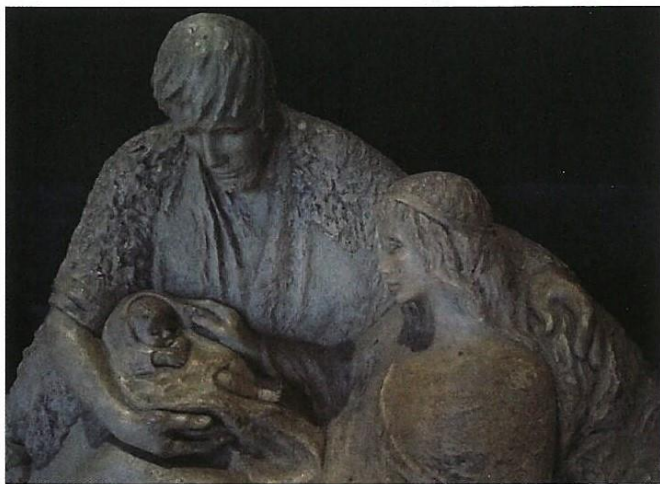
Holy Family sculpture by Josephina de Vasconcellos