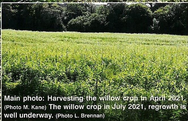
Main photo: Harvesting the willow crop in April 2021. The willow crop in July 2021, regrowth is well underway.

The establishment costs are considerable but the return on investment is also considerable. It is estimated that the pay-back period is between eight and nine years which represents approximately an 11% annual return on investment. Teagasc has done calculations on the savings achieved by the changeover from oil central heating to willow biomass heating. One unit of heat produced by oil costs on average 0.07 euro (7 cents). When all expenses of willow biomass production are taken into account