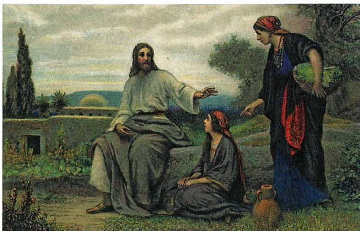
Jesus with Mary and Martha.

In telling the story of Jesus' visit to his women friends in today's Gospel, Luke underlines the importance of the guest: Martha addresses Jesus as Lord, while Mary sits at the Lord's feet. This is not a casual visit. In response to Jesus' presence, Martha becomes fully engaged in preparing a meal while Mary becomes fully engaged in listening to the Lord. The scene of Mary sitting with her guest is a world away from the religious practice of the day: women were not instructed in the Law by the rabbis because they could be neither a teacher