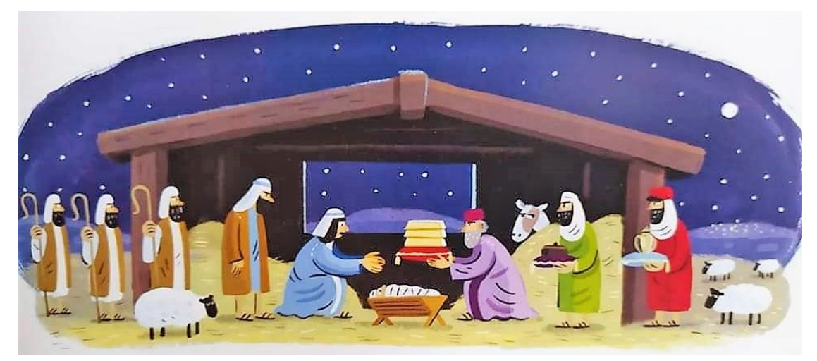
"Oh good, now we can put the heating on"

'Just a short note to say how lovely it was to be with you all for the Advent Cluster Retreat....It was great testament to faith that so many people braved the bad weather to make the journey to Leith for the Mass and our time together. I am glad to hear that those who took part found the morning to be of some benefit. Thank you for the lovely card and book token, and also for the collection that was taken up. So kind and generous, and very much appreciated. Please pass on to the Cluster my sincere gratitude.'