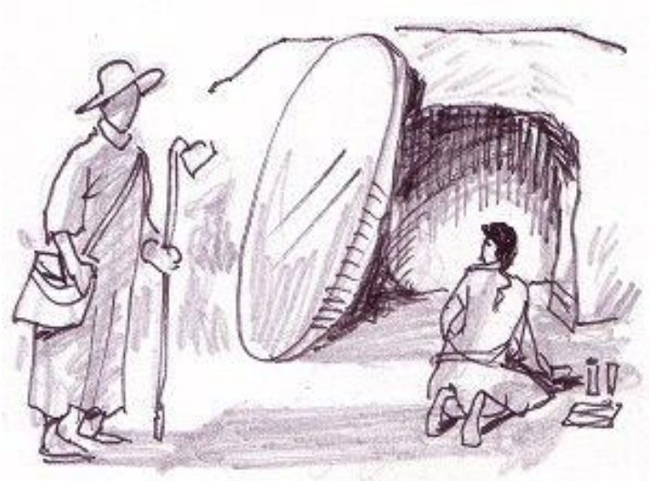
Mary at the Tomb