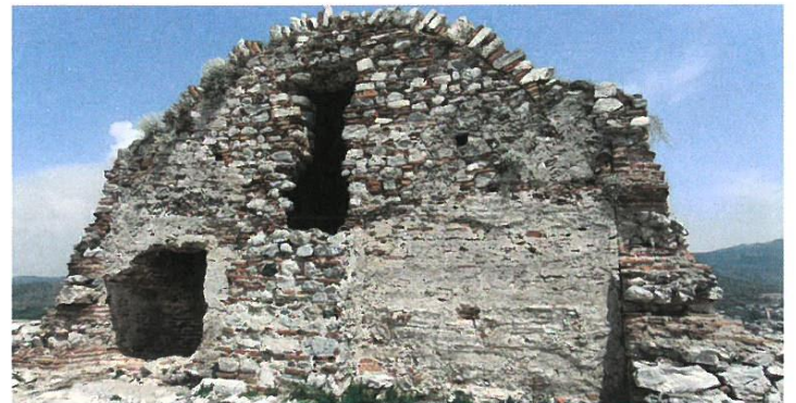
Remains of St John's house, Ephesus.