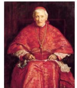
St. John Henry Newman

All are warmly invited to attend. A donation is requested to cover our costs of the talk.