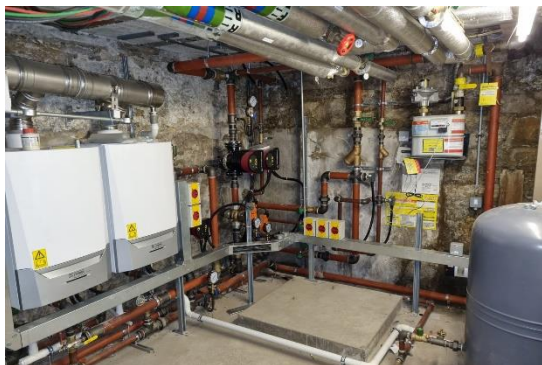
New Church Boiler Room

Renewal of St John’s Central Heating System - The installation of the new radiators commenced three weeks ago. Two new gas boilers are already in situ in the church basement. The entire works should be completed in the next week or so (and we know we’ve promised that already!). Your continued patience is appreciated – especially by those invited to go to St Mary Magdalene’s for most of this week’s weekday Masses, while the work continues in St John’s. NB The FIRE DRILL that was ‘promised’ for the coming weeks has been postponed till after the radiators are working.